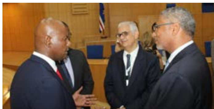
Hon. Abshir Aden Ferro with HE Nizar BARAKA, Minister for Infrastructure and Water of the Kingdom of Morocco