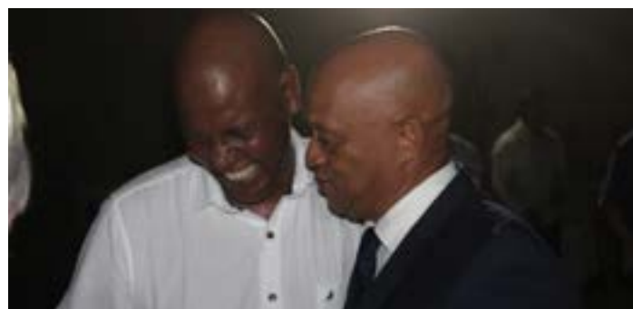
Hon. Abshir Aden Ferro with Luís Filipe Lopes Tavares, Vice-president of the MPD, Former Minister of Foreign Affairs and Communities & Minister of Defence of Cabo Verde