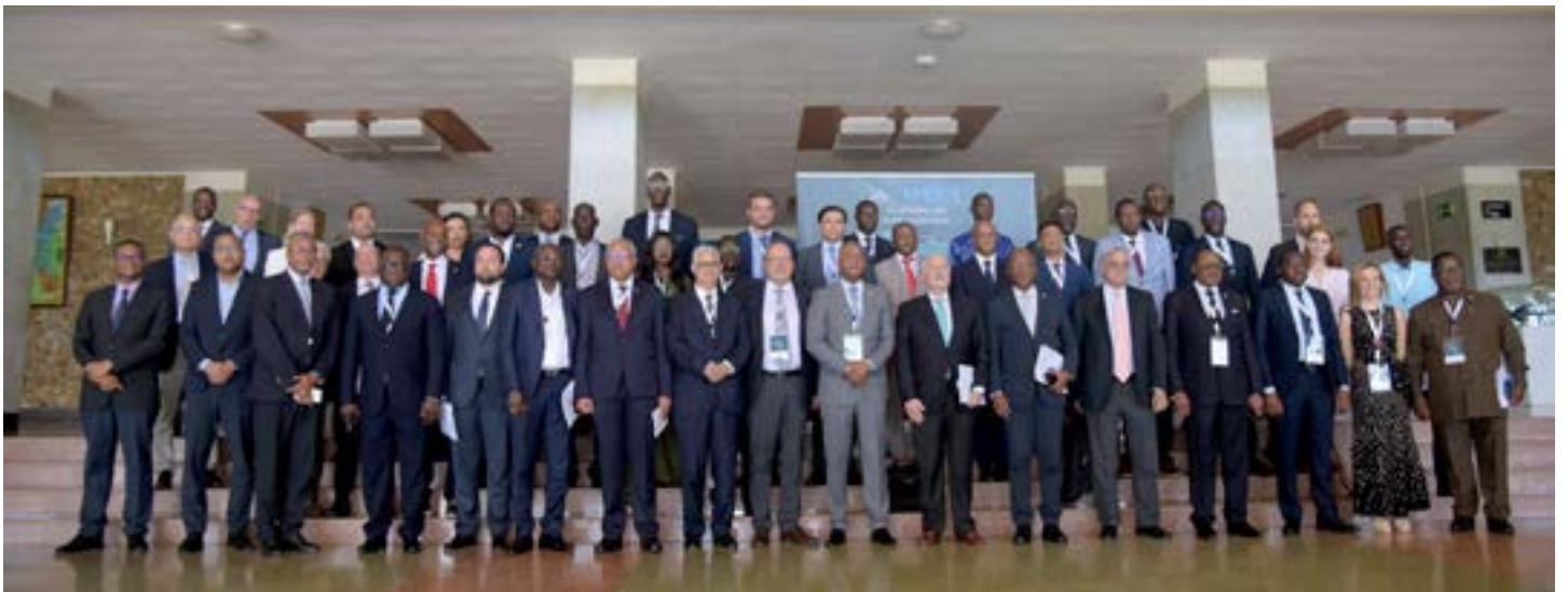
Family picture of the Congress